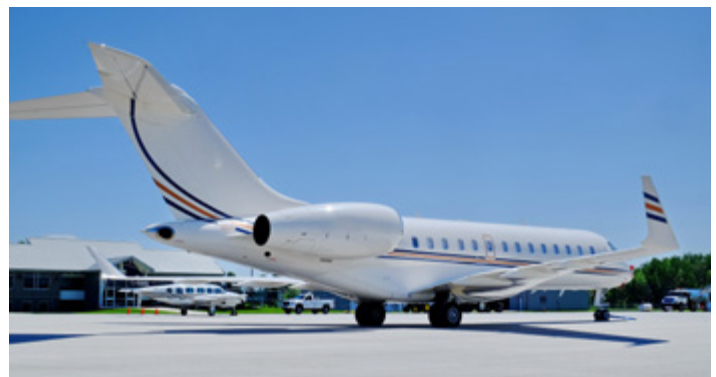
Lake Simcoe Regional Airport

Lake Simcoe Regional Airport Aerospace Development Fund to stimulate private sector investment