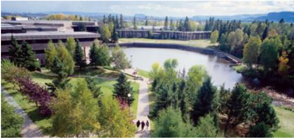
Thunder Bay campus